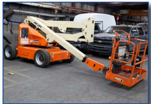
JLG E450A ELECTRIC BOOM LIFT, 45 FT CAP.