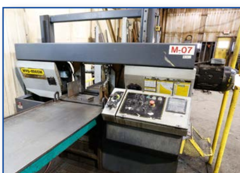
HYD-MECH H14A FULLY AUTO. BAND SAW