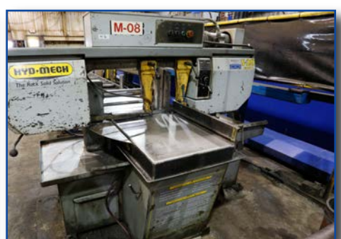
HYD-MECH S20A SERIES II AUTO. BAND SAW, 20" CAP.