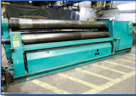
BIKO 3HCD DOUBLE INITIAL PINCH 3-ROLL HYDRAULIC BENDING ROLL