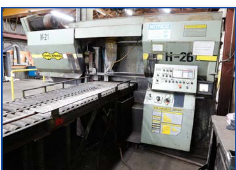
HYD-MECH H-26 AUTO. BAND SAW