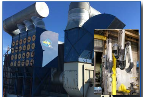
CPI 100 HP DUST COLLECTOR SYSTEM