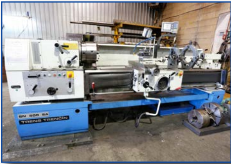
TOS TRENCIN SN500SA HD GAP LATHE, 20" SWING X 7 FT CENTERS