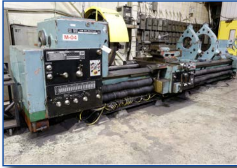
TOS SU100 HD ENGINE LATHE, 42" SWING X 13 FT CENTERS