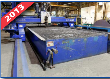
MACHITECH AUTO. PC-1000 PLASMA/DRILLING TABLE, 30 HP HEAD (2013)

COMPLETE FABRICATION, MACHINING AND WELDING & SAND BLAST DEPARTMENTS, 2013 PLASMA/DRILLING TABLE (44) OVERHEAD BRIDGE CRANES AND JIB HOISTS TO 30 TON, SITE ERECTION EQUIPMENT, RIGGING EQUIPMENT, FACTORY EQUIPMENT AND SUPPORT, (21) SERVICE VEHICLES, OFFICE FURNITURE AND EQUIPMENT & MORE