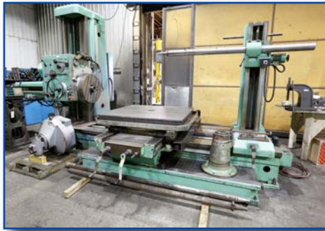
TOS W-100 4" TABLE TYPE HORIZONTAL BORING MILL