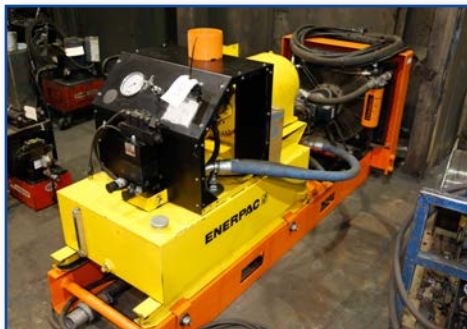
ASSORTED HYDRAULIC POWER PACKS