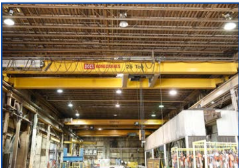
(44) OVERHEAD BRIDGE CRANES AND JIB HOISTS TO 30 TON