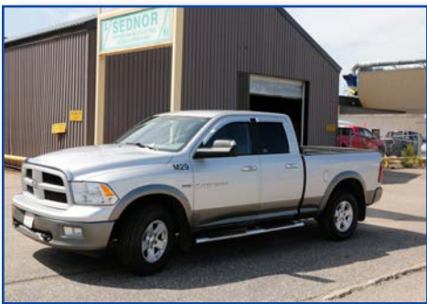
(21) SERVICE VEHICLES AS NEW AS 2012