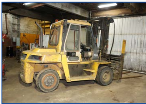
FORKLIFTS UP TO 15,000 LBS CAP.