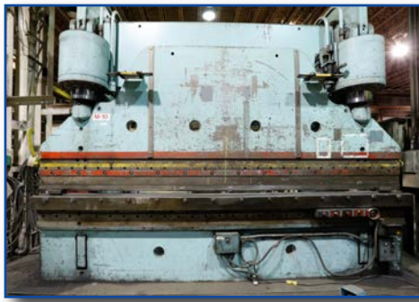
CINCINNATI 400H SERIES 400 TON X 14 FT OVERALL HYD. PRESS BRAKE