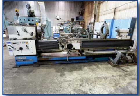
TOS TRENCIN SN 710N HD GAP LATHE, 28" SWING X 126" CENTERS