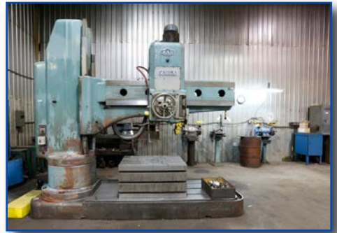
MAS VR6A 6 FT BOX TYPE RADIAL DRILL