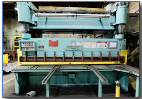
CINCINNATI 5FL10 10 FT X 5/8 HYD. POWER SHEAR